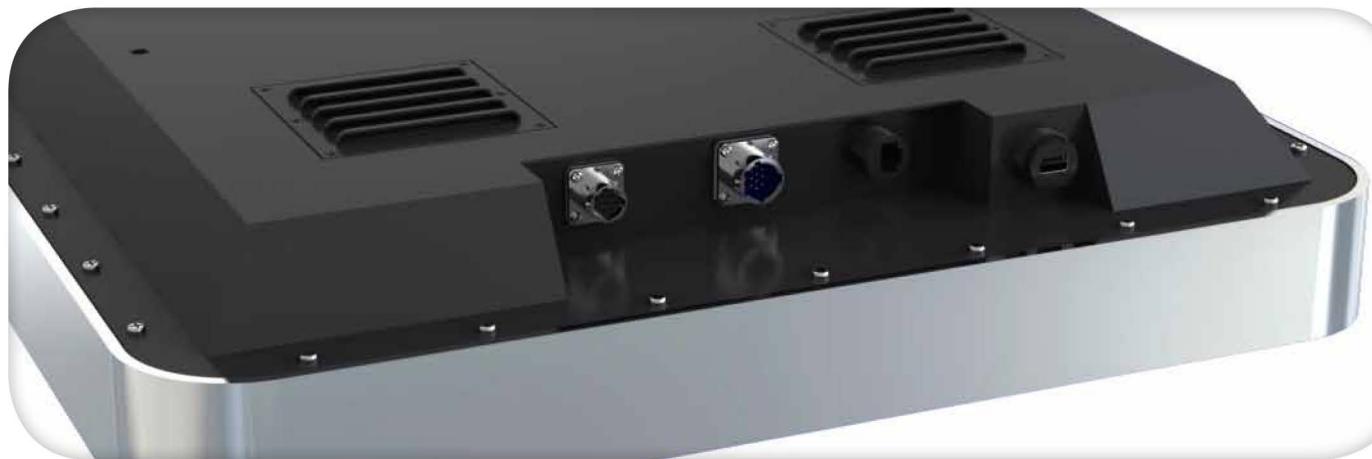
IP65 Rated Waterproof AV Inputs