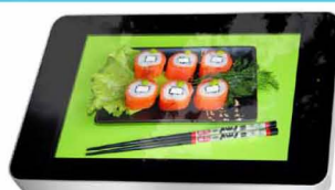
Anti Reflective Glass