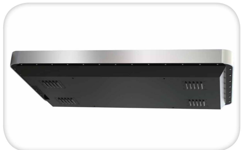
Aluminium Surround and Rear