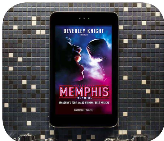
Product In Situ