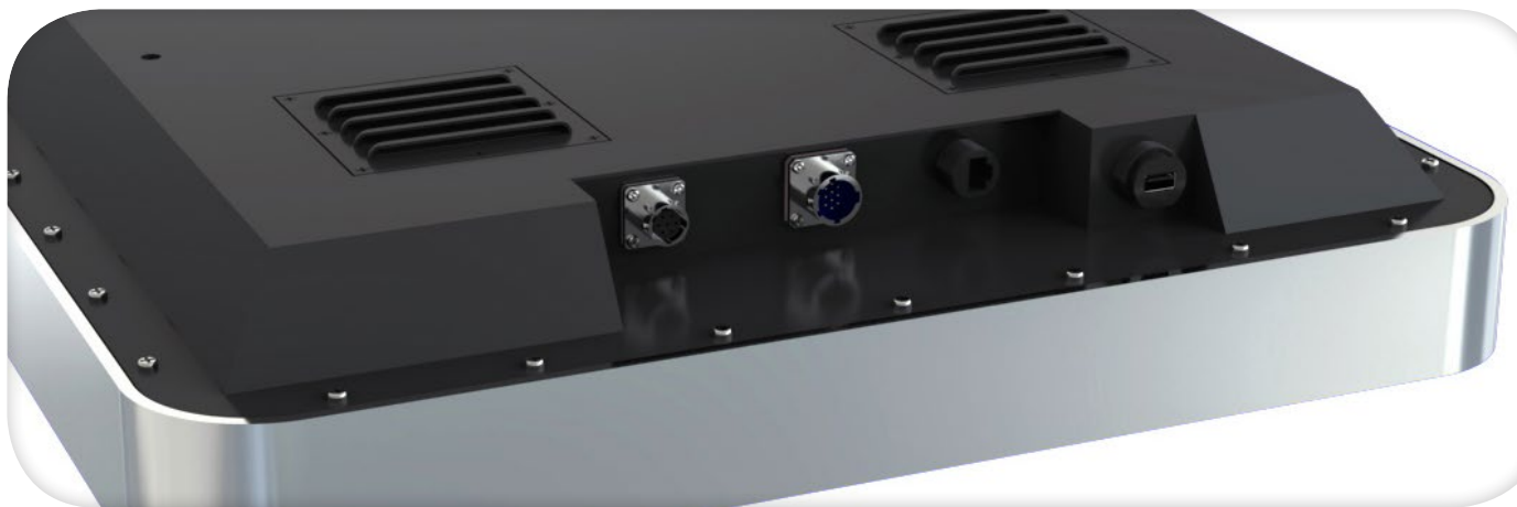
IP65 Rated Waterproof AV Inputs