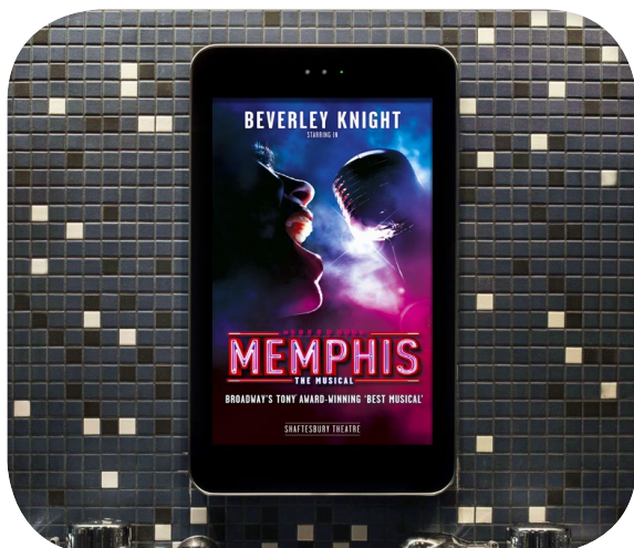
Product In Situ