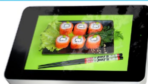
Anti Reflective Glass