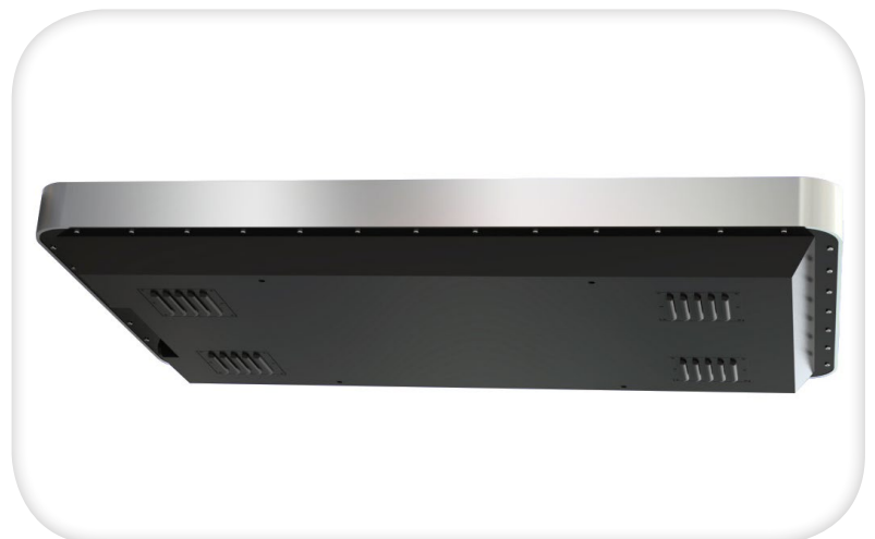
Aluminium Surround and Rear