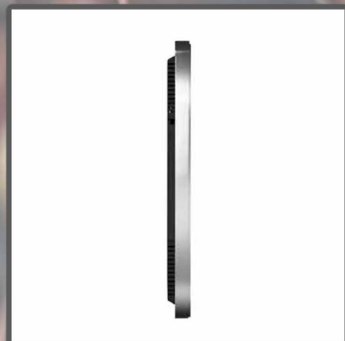
22" Slimline Digital Advertising Display