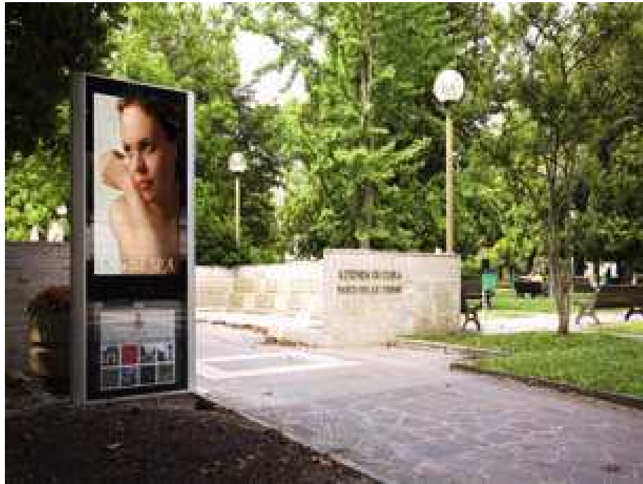
ABANO TERME (PD), ITALY - DOWNTOWN