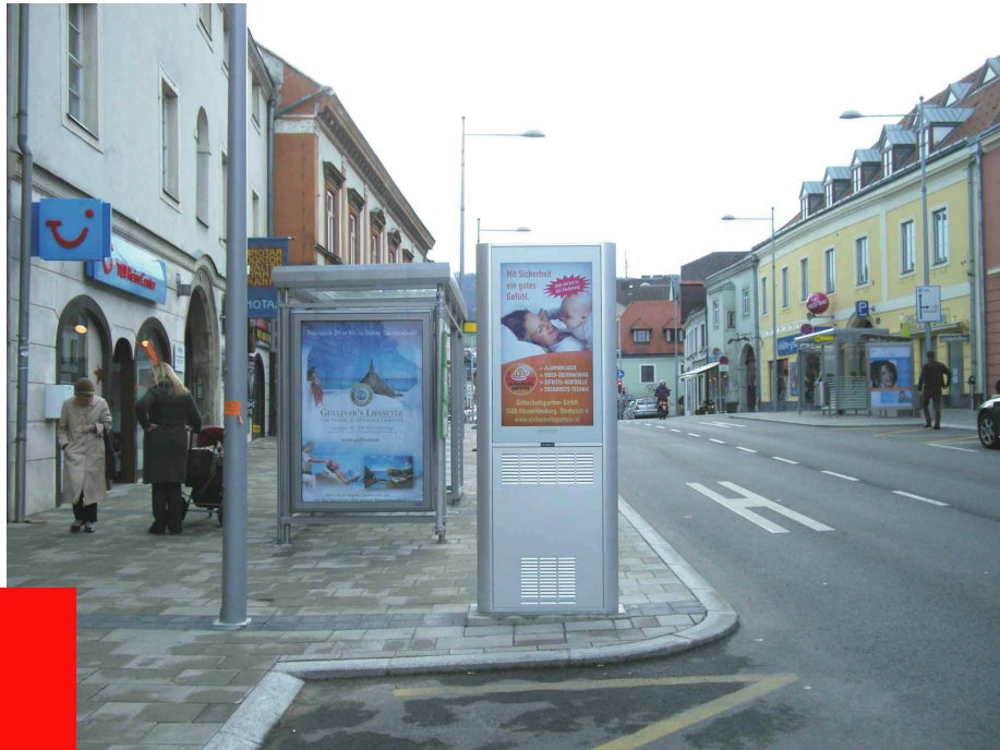
WIEN (AUSTRIA), DIGILIGHT URBAN NETWORK